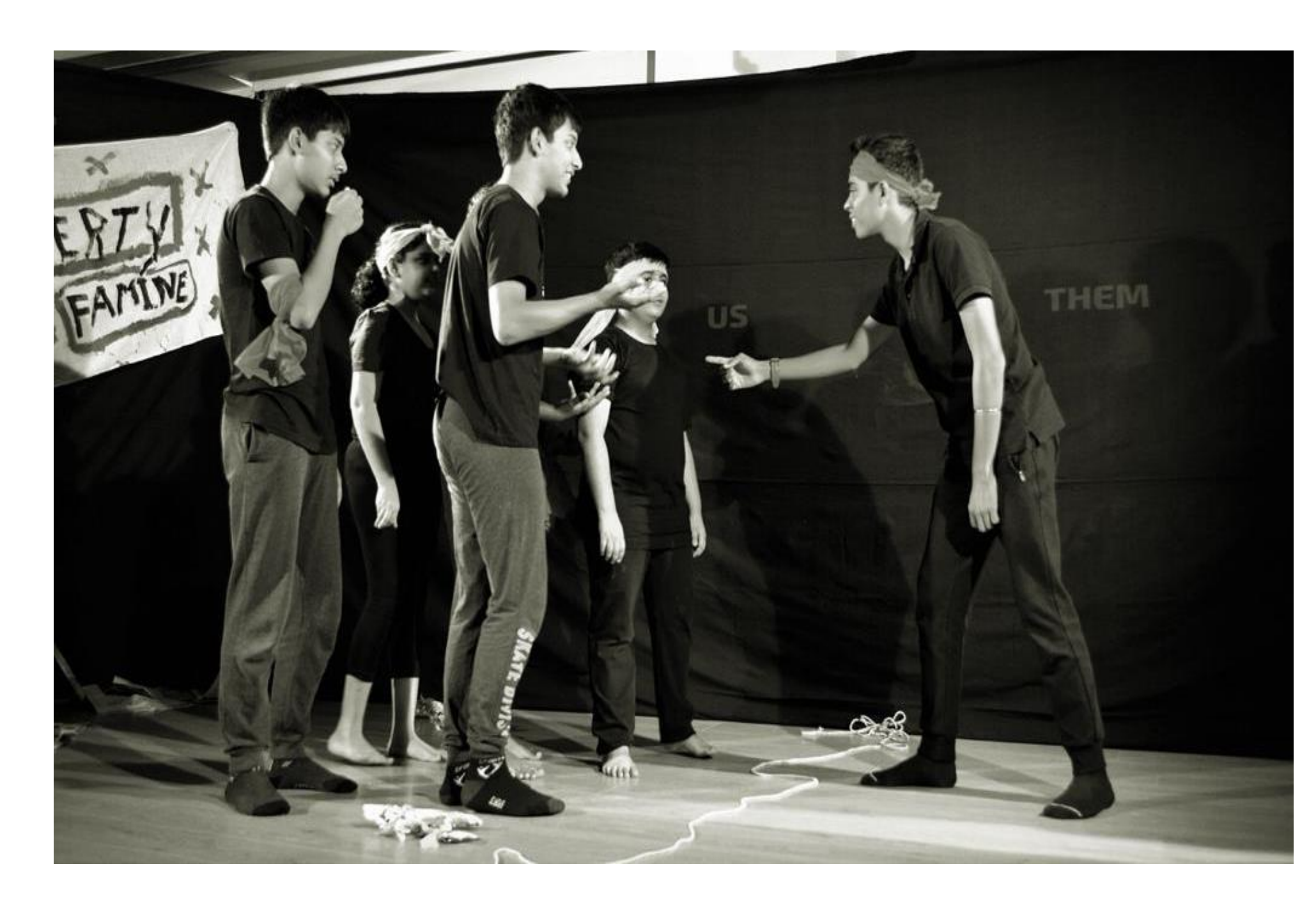
Trusted by over 2000 parents globally!